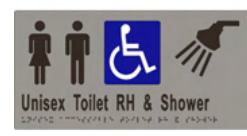
Signage Unisex Accessible Toilets LH/ RH Transfer & Shower - Braille ML16298 (RH) ML16297 (LH)