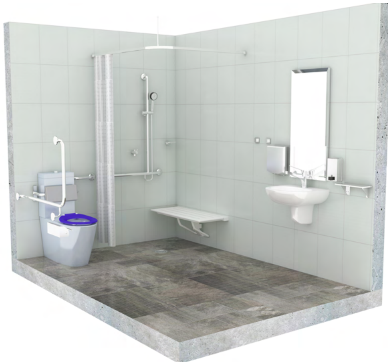
Representational image of an Accessible Toilet and Shower including Metlam Australia Commercial Washroom Accessory products. Other bathroom layouts available.