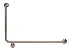
90° Flush Mount Side Wall Grab Rail MLR104_X (RH) MLR103_X (LH)